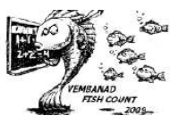
Table 2 -Species list Vembanad Fish Count