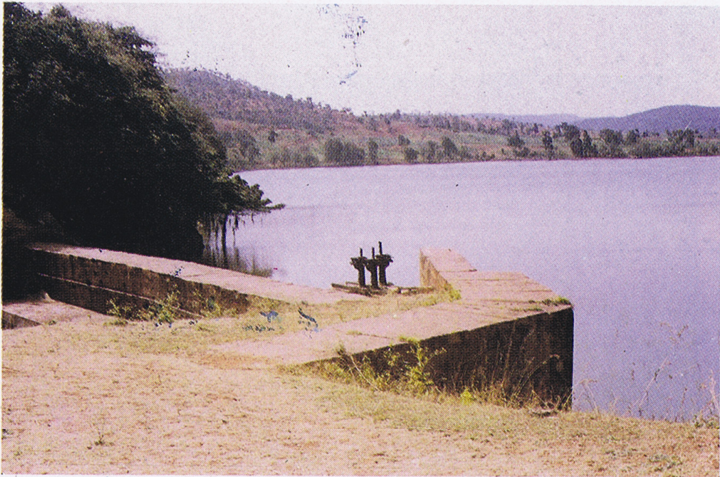
Kadur - Madaga Tank