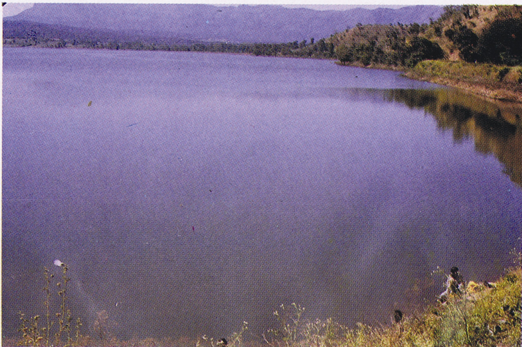
Waterspread of Kadur-Madaga Tank.