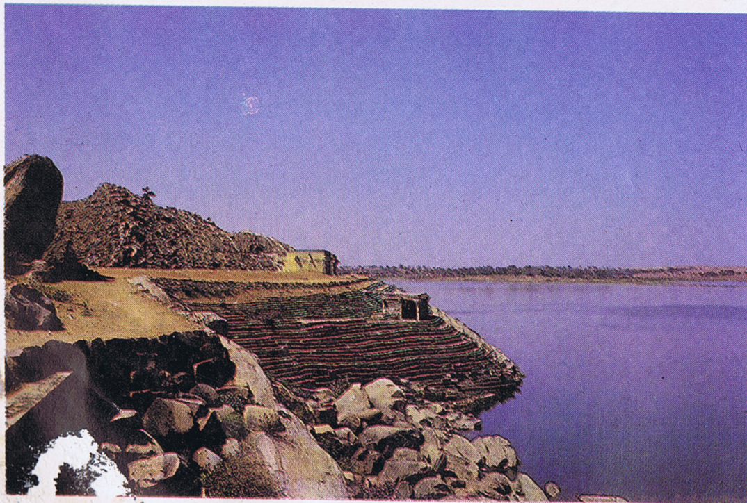
Tonnur Tank or Moti Talab