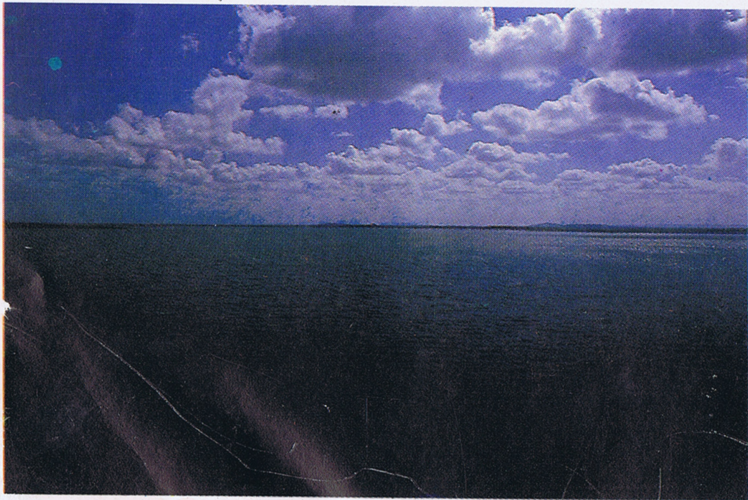
waterspread of Shantisagar