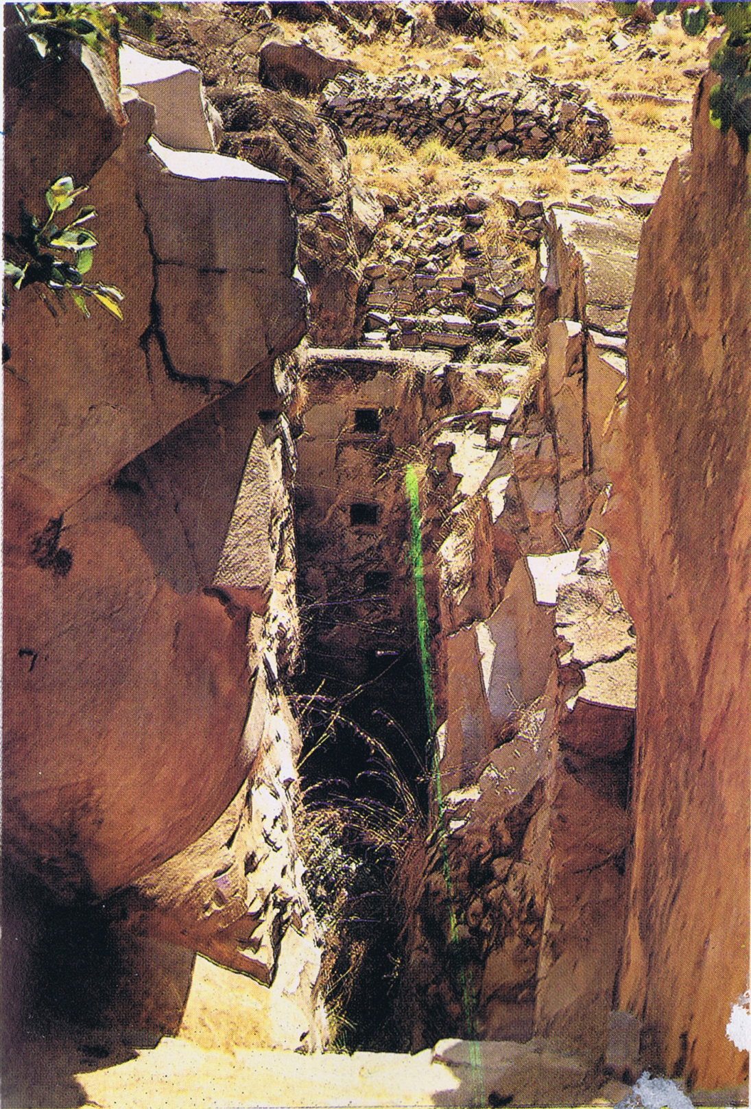
Channel cut through at Moti Talab