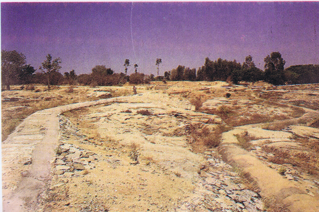
Channel ducts at Ramasagar