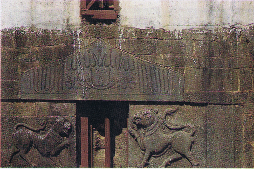
Inscription at Madag-Masur sluice