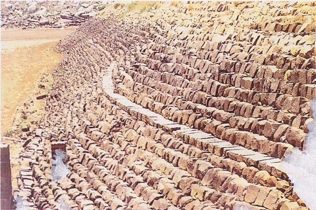
Revetment at Watadahosahalli Ta