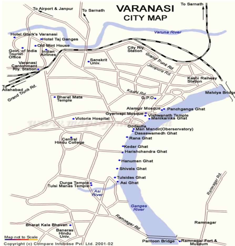
Figure – 2.1 ; Map of Varanasi City

that is, from both surface and ground water, whereas in trans-Varuna area the water supply is exclusively from ground water. The source of surface water is river Ganga. Deep tube wells, hand pumps and private bore wells are the main sources for extraction of ground water in the city to cater to the water demand of the population. The depth of ground water varies from 3.02 to 15.25 m in various parts of the city. Apart from municipal sources of water supply, a large number of consumers also have shallow hand pumps for augmenting their water requirements.