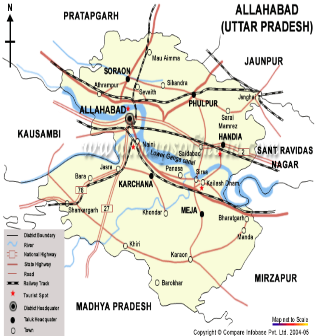
Figure – 2.1 Allahabad City