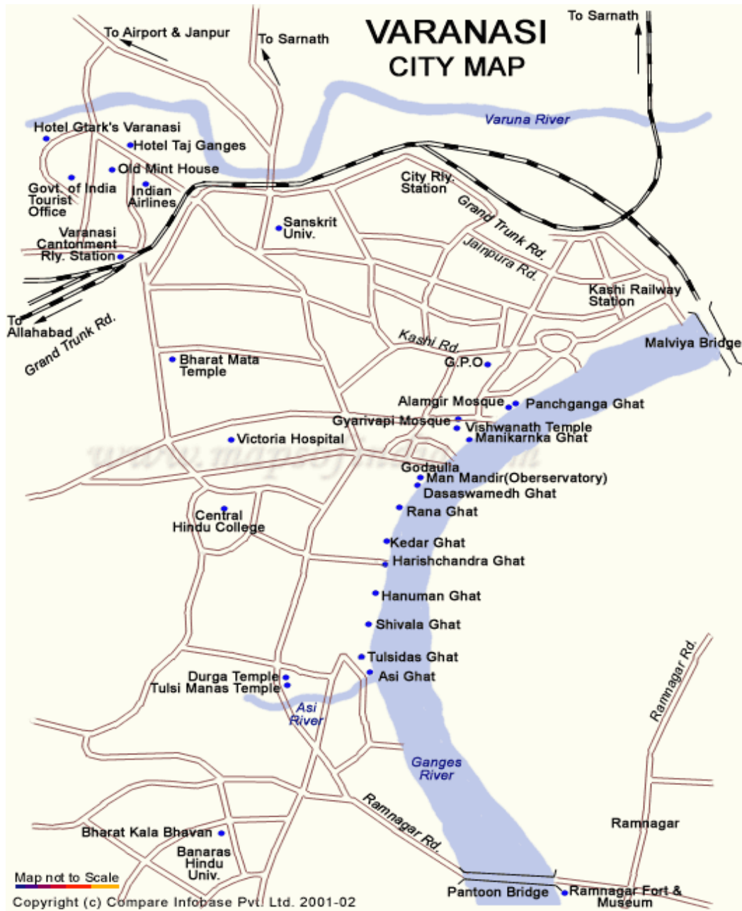
Figure – 2.1: Location Map showing GWQ sampling location of Varanasi City