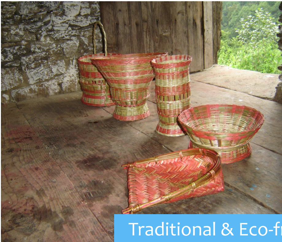
Traditional & Eco-friendly lifestyle of people