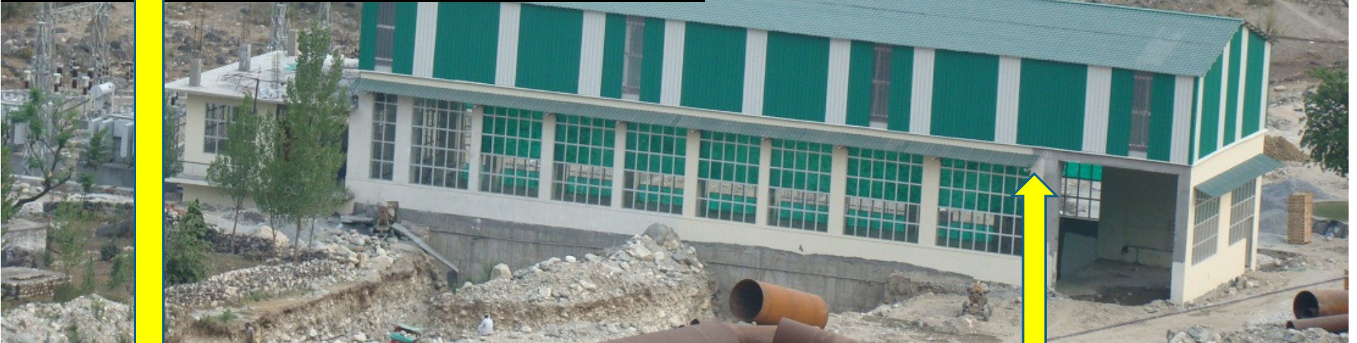
Micro Hydro Power Plant Gangani & Distruction by cloud brust 2012