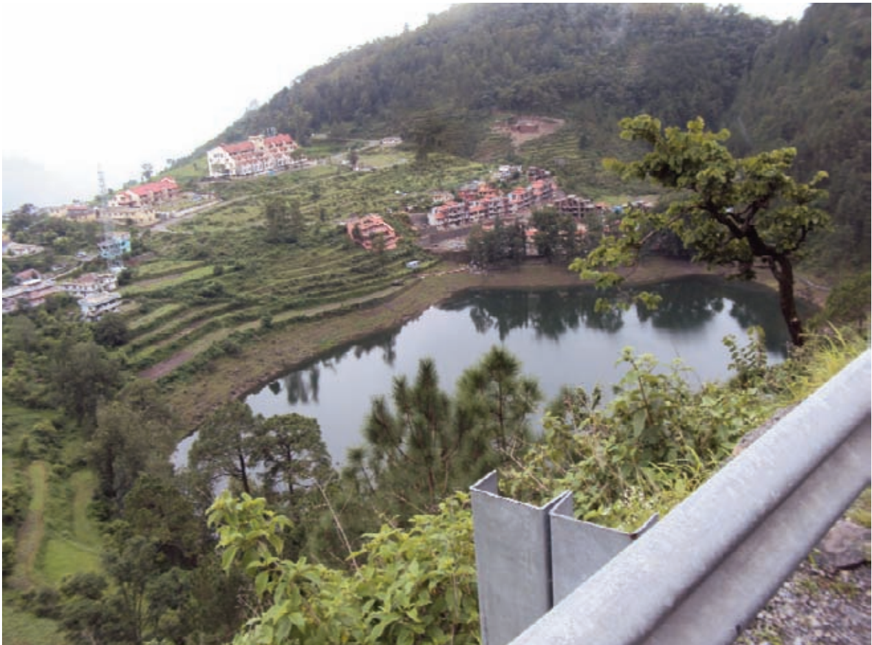
Photograph 6: Upcoming housing project near Khurpatal, Uttarakhand.

the Army Welfare Housing Organization (AWHO). The builders have bored in the adjacent areas of the lake in 2002 and since then the lake water started to decline. Residents of at least seven villages downhill of the lake are facing water shortage because of the project. They observed the reduction in the flow of water in their springs first in the summer of 2003, a year after AWHO began construction work on its colony of 80-housing units. The spring flow in these villages become negligible during the lean period and most people in the area have already abandoned farming and started migrating for contract labour 8 . Dr. Ajay S. Rawat, Professor of History in Kumaon University was successful in bringing the case to the notice of Uttarakhand High Court in 2009.