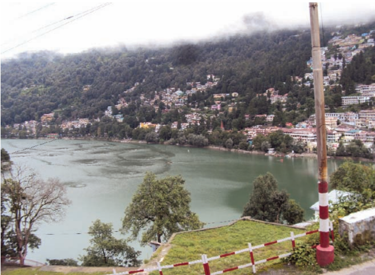
Photograph 8: Conserved Naini lake, Nainital, Uttarakhand

Source: Rawat, A.S. and Raju, S. 2010. Nainital Beckons. 60 p.