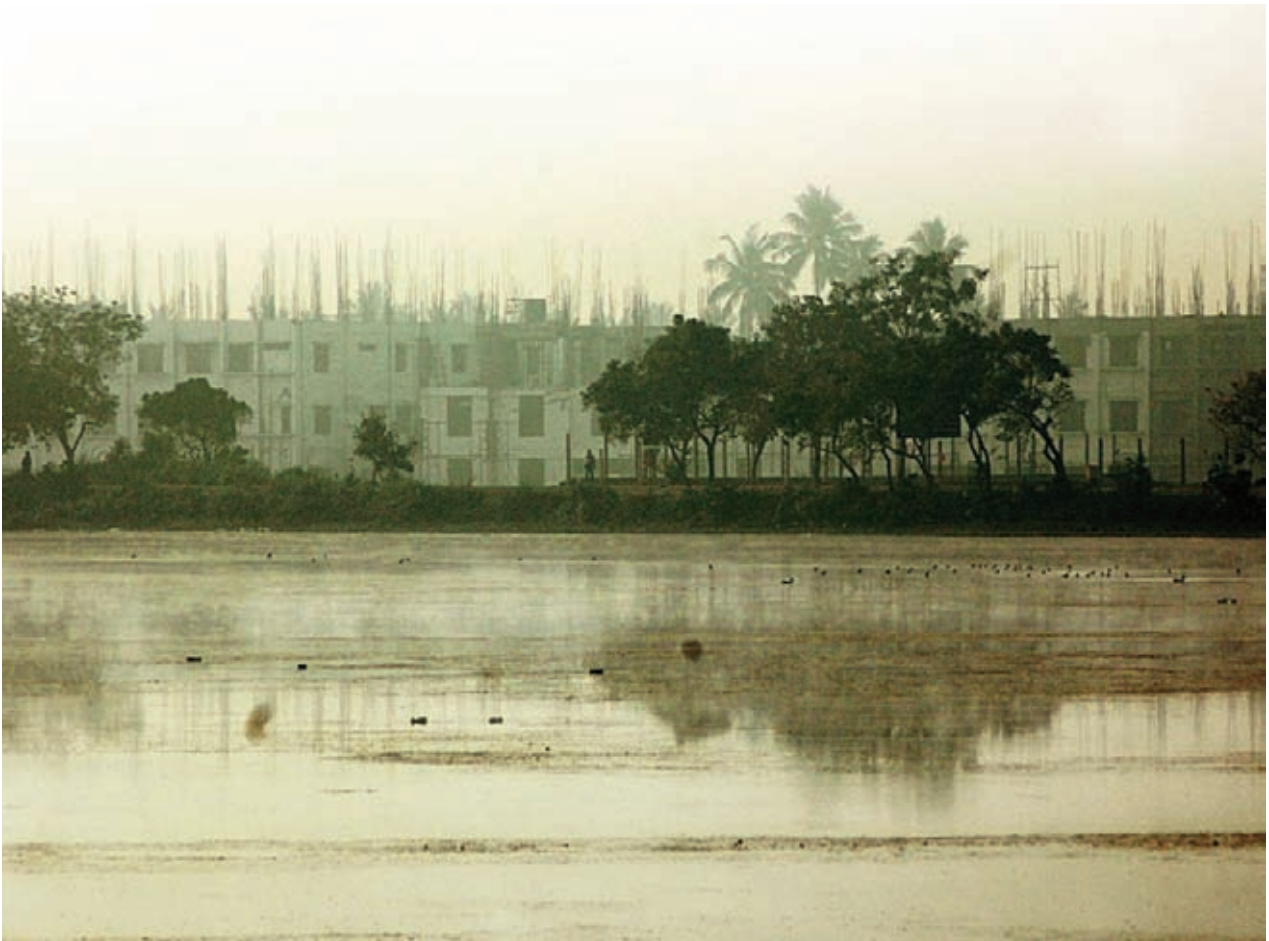
Photograph 7: Construction near the Ousteri lake, Puducherry, February 2006

21 NGOs in Puducherry formed the Ousteri Protection Coordination Committee (OPCC) in order to save the waterbody. In 2006, OPCC protested against the Environment Impact Assessment report submitted for the project clearance. OPCC also filed a PIL in the High Court of Tamil Nadu against the Union of India, PWD, Pondicherry Pollution Control Committee and the Trust, regarding the illegal construction of Medical College and Hospital adjacent to the Ousteri Lake. The case is pending in the court for more than five years. The college has already started functioning. In spite of all the efforts by the civil societies, the movement is facing an uphill battle because of absence of any administrative framework to protect the waterbody.