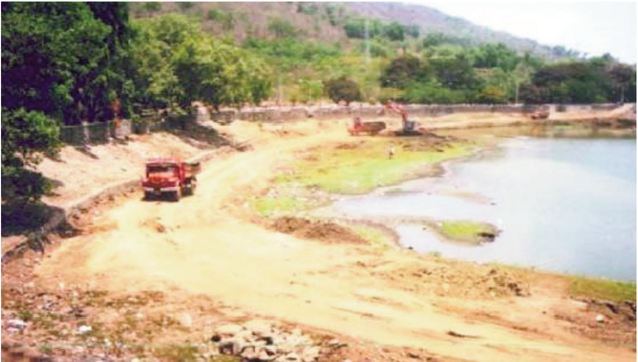
Photograph 9: Upvan lake before the restoration process