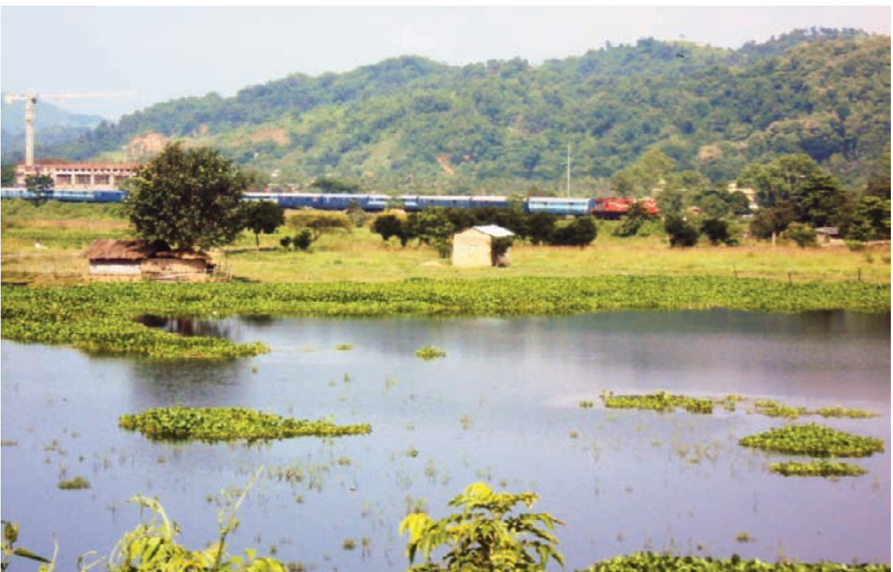
Photograph 5 : Encroachment of the Deepor beel by railway tract, Guwahati, Assam