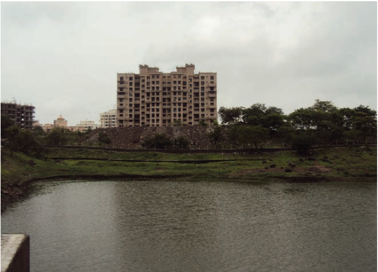
Photograph 10: Restored Upvan lake