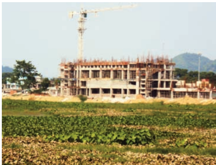
Photograph 3 : A building constructed in the middle of Deepor beel, Guwahati, Assam

Besides functioning as a major rainwater storage basin for Guwahati, Deepor beel has an immense biological and ecological significance. It was designated as a Wildlife Sanctuary in a preliminary notification in 1989 and was declared a Ramsar site in 2002. The beel is also an important staging site for migratory waterfowl. The waterbody is a home to a large number of vegetation and animals, including some endangered species such as spotbilled pelican and greater adjutant stork. However, the high biodiversity of the wetland ecosystem is being threatened due to degradation in water quality, illegal poaching and considerable human-induced disturbances.