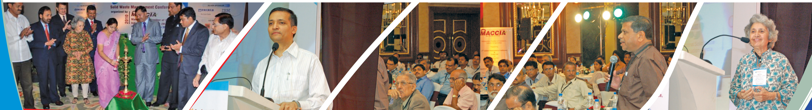
Glimpses of Solid Waste Management Conference held at Mumbai, Aurangabad & Nashik