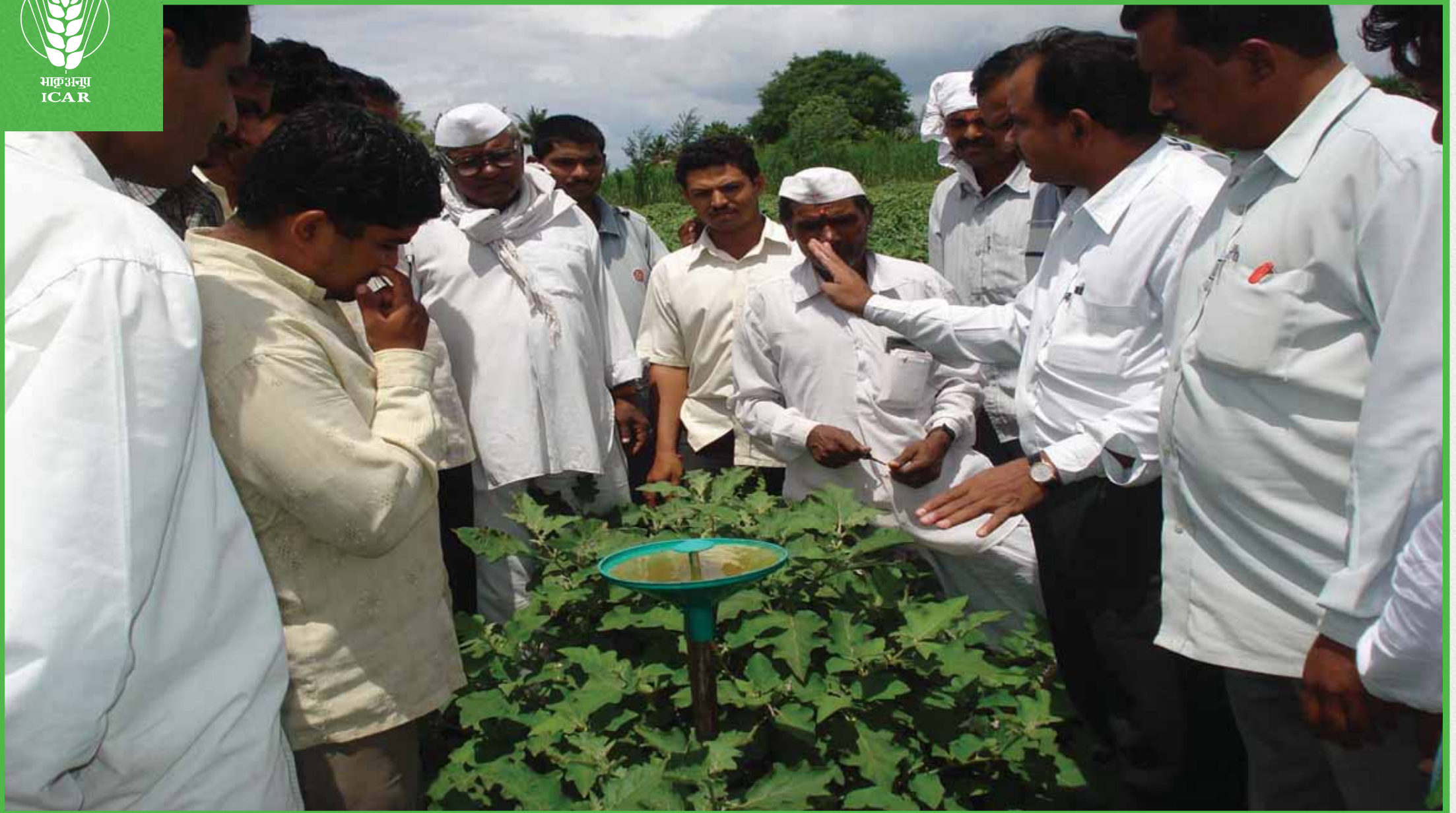
KVK Ahmednagar, Maharashtra