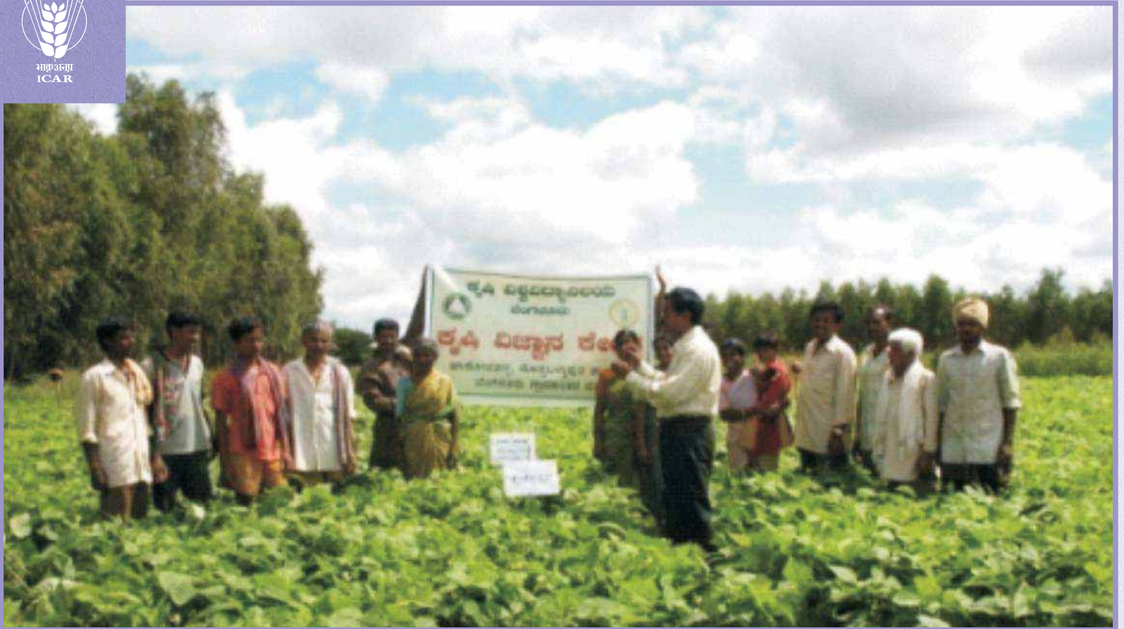
KVK Bengaluru Rural, Karnataka