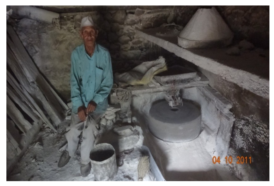
Photo - 1 Gharat owner using traditional watermill in Ganeshpur, Uttarakashi