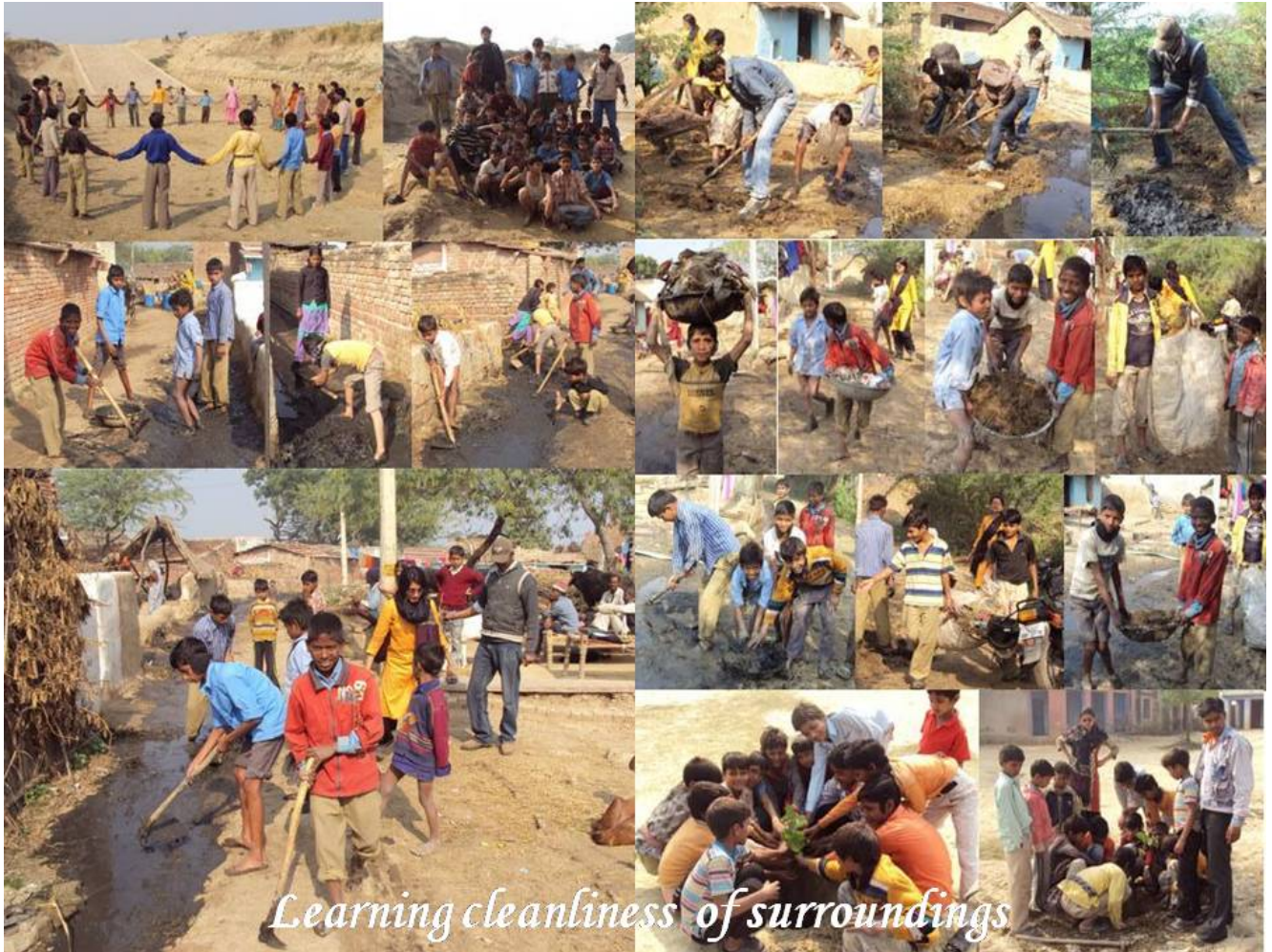
Learning cleanliness of surroundings