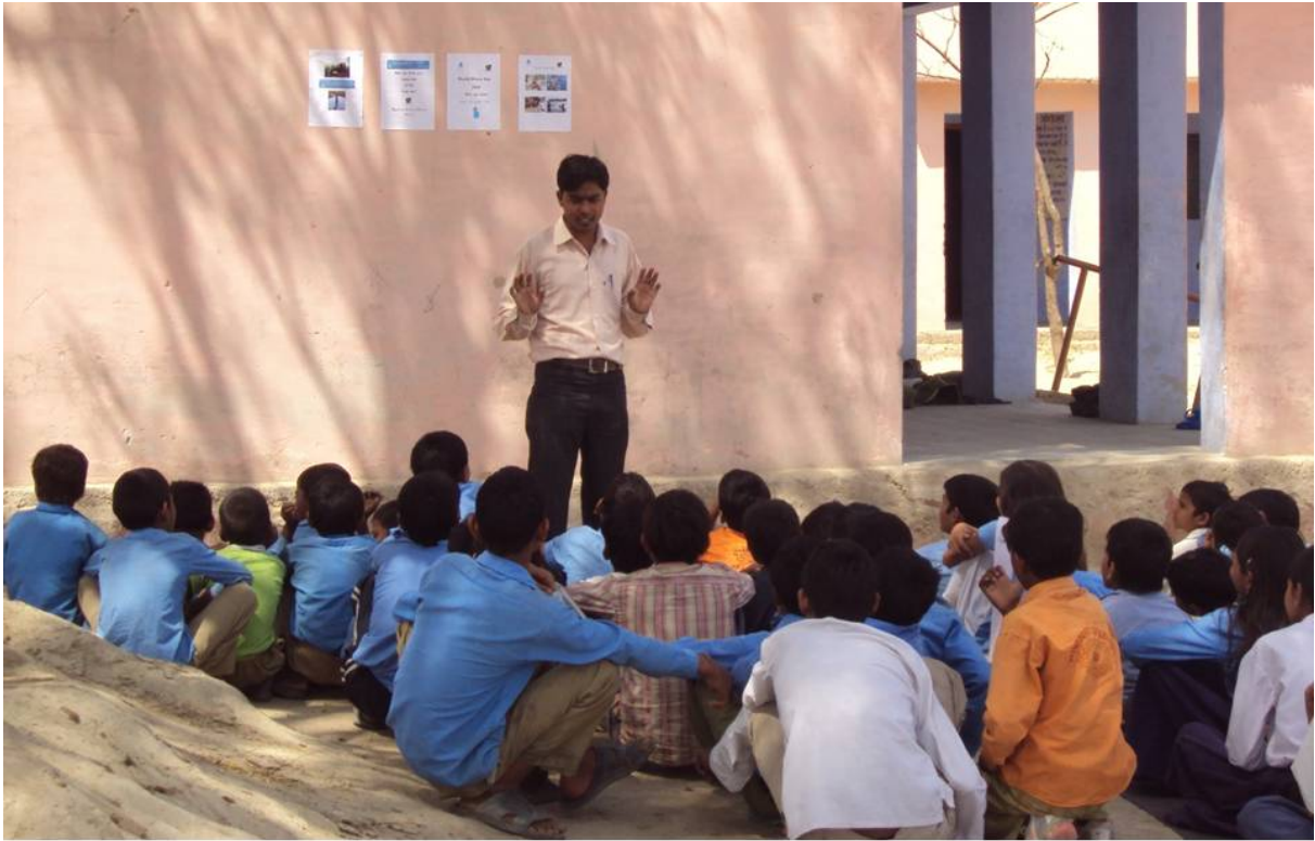
Learn about our wetlands (World Wetland Day)