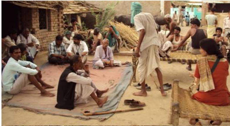
Wrap up meeting with the village community representatives 30 May 2010