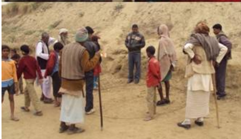
Decision making meeting for the site of new well 9 December 2009