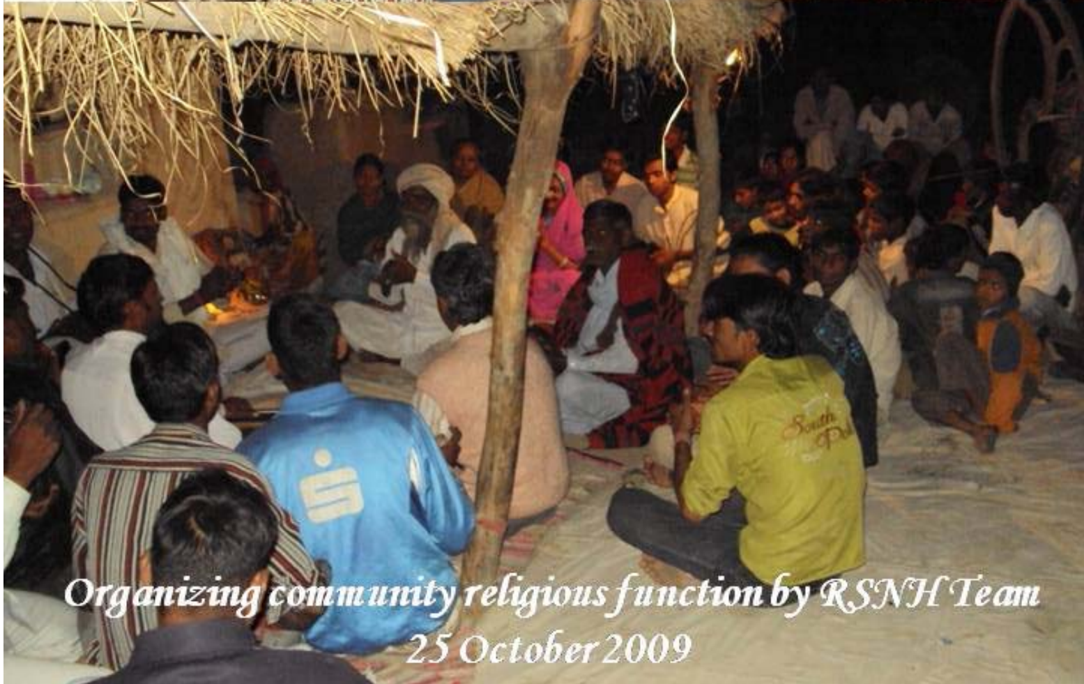
Organizing community religious function by RSNH Team 25 October 2009