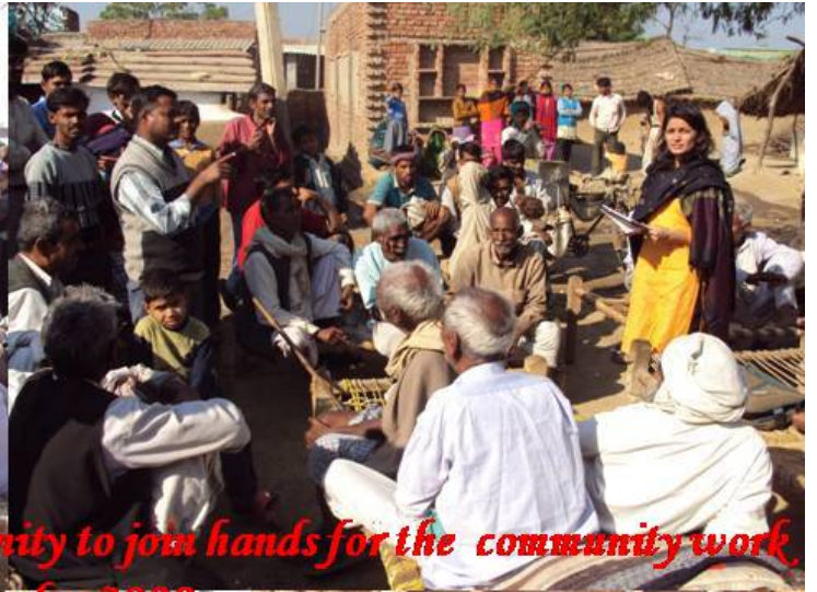
Meeting to motivate the village community to join hands for the community work 23 December 2009