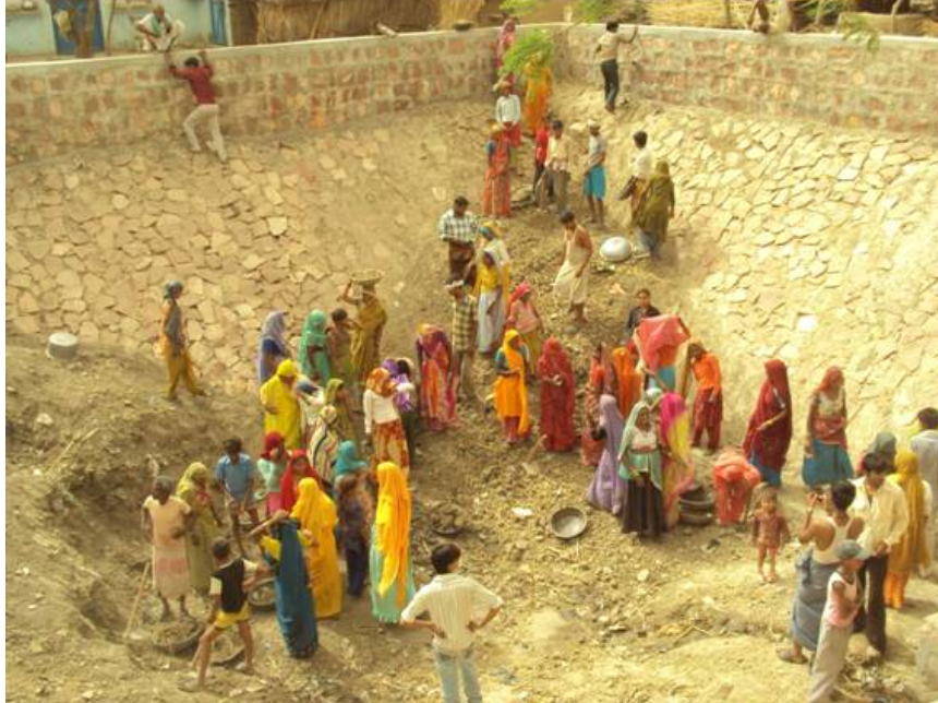
Impact of Project Boond Volunteer work by village community specially women to clean village pond 3 June 2010