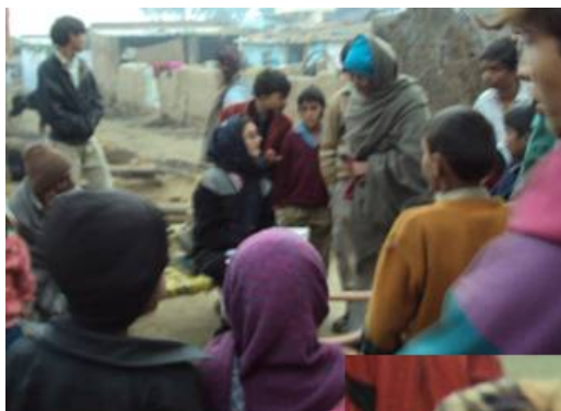
Updating the development to the village community representatives 18 January 2010