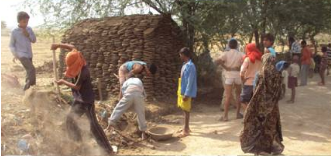
Impact of Project Boond Volunteer work by village community specially women to clean village pond 29 April 2010