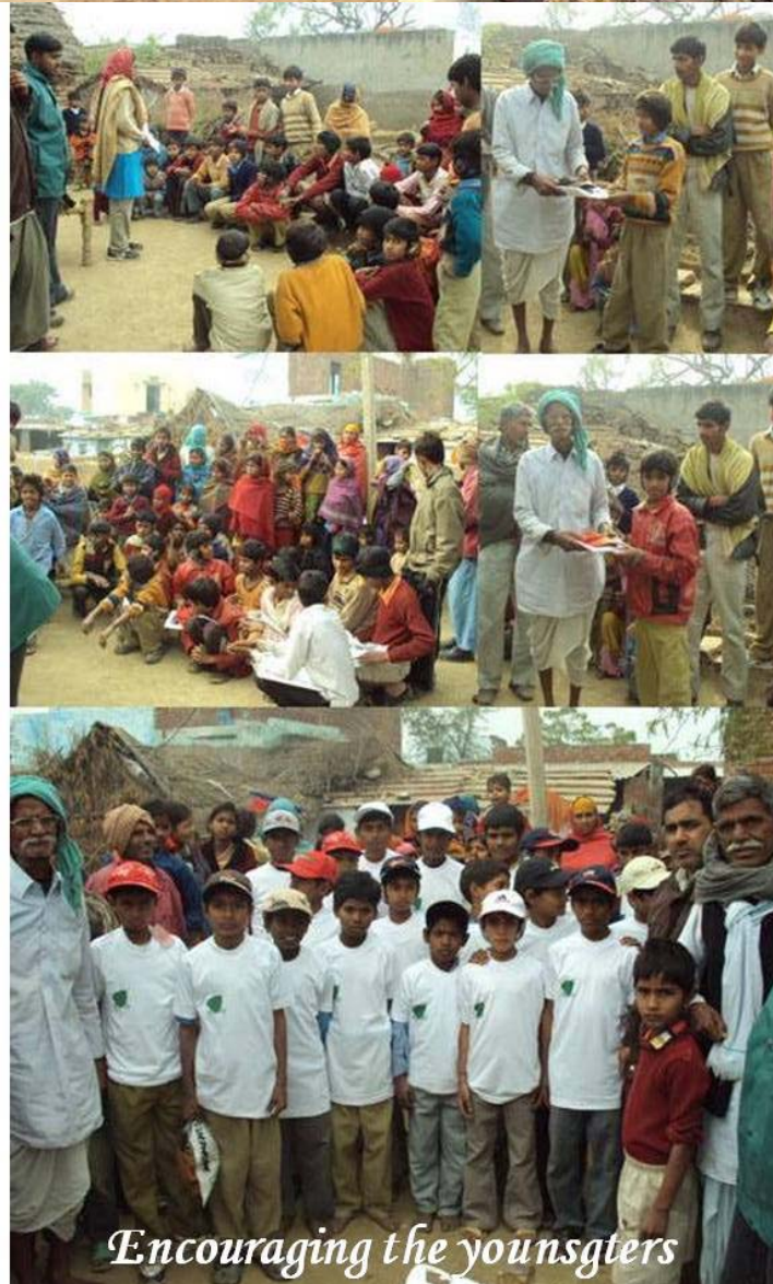
Encouraging the youngsters