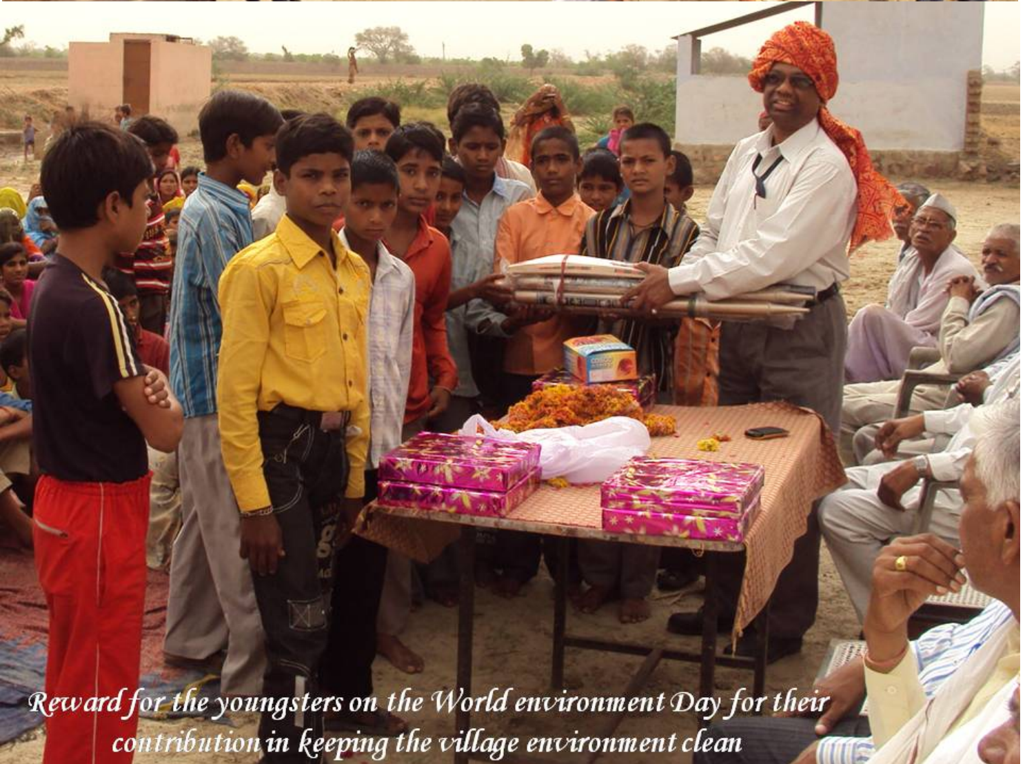
Reward for the youngsters on the World environment Day for their contribution in keeping the village environment clean