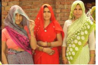
Women SHG Representatives