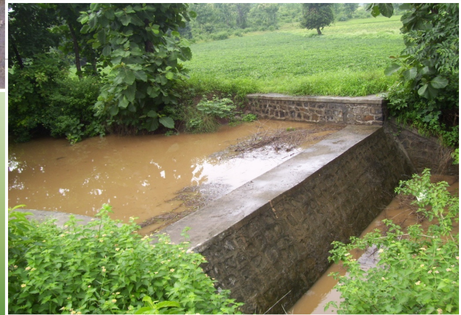
Cement Nala Bund

Constructed By : NGO :- Savata Mali Samaj Vikas Shaikshanik & Bahuddeshiya Buldana VWSC : Panlot Vikas Samittee, Usran