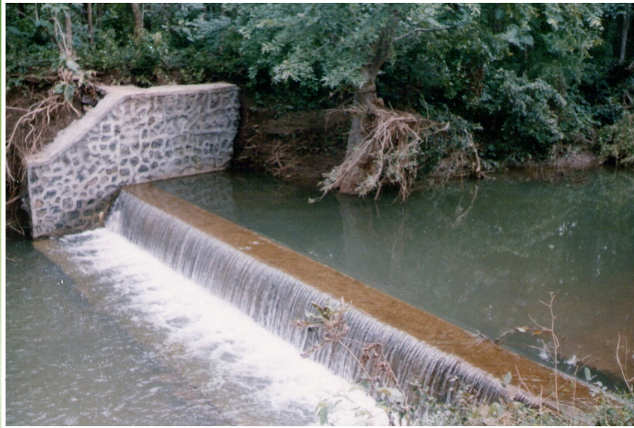
Cement Nala Bund