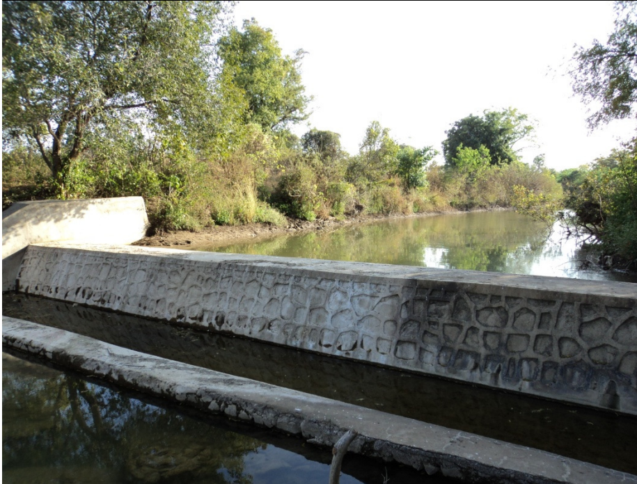
Cement Nala Bund