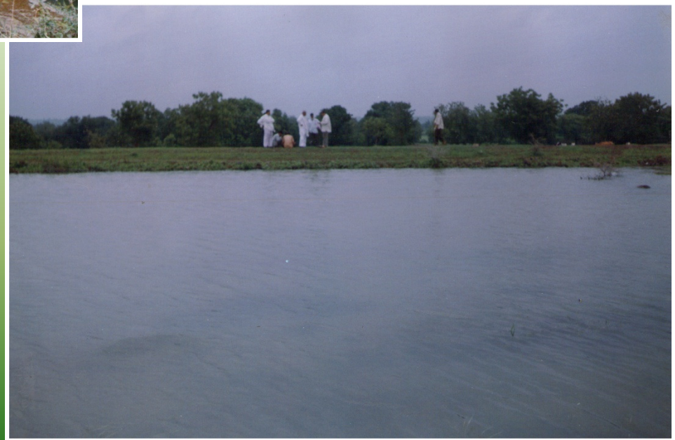
Earthan Nala Bund