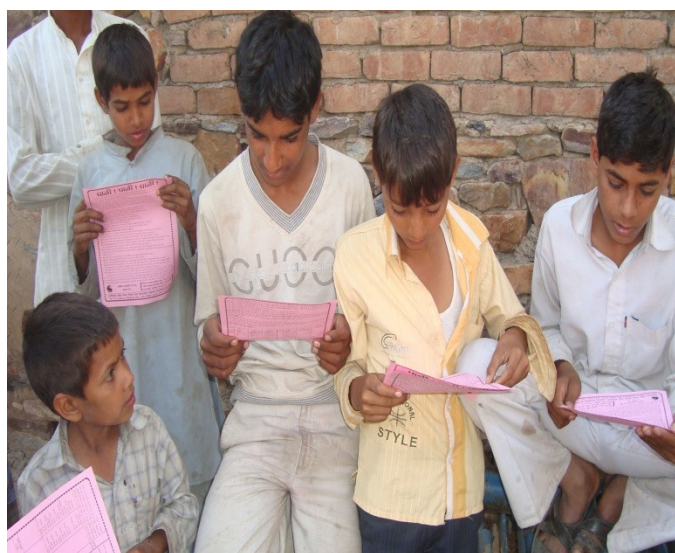
Everyone was busy in reading pamphlet of JCY