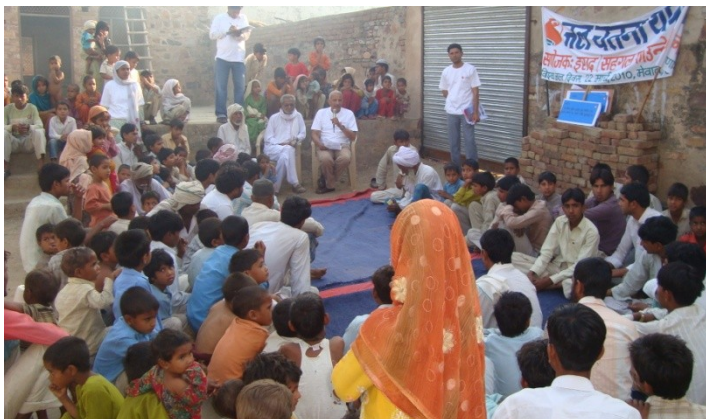
Villagers assembling to discuss their water problems