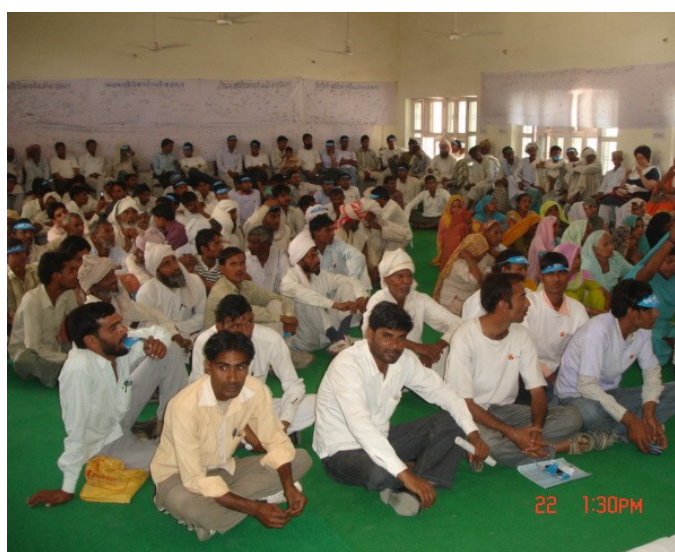
Large turnout for public meeting in Nuh