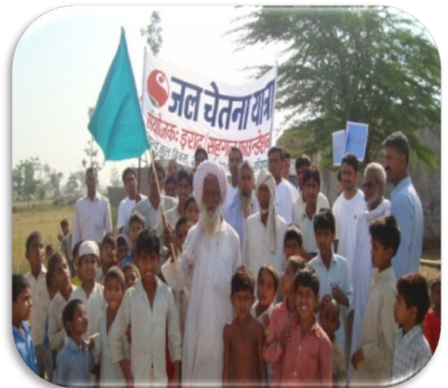
The oldest person of village flagging off the Yatra