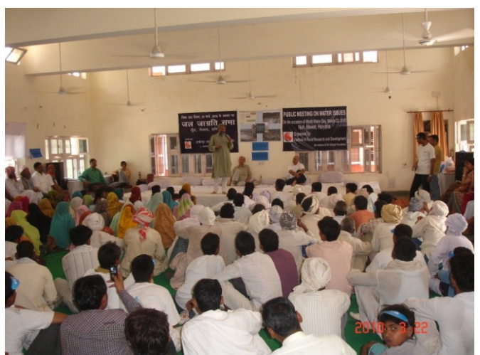
Shri Rajendra Singh, Magsaysay award winner addressing the large public gathering in Nuh