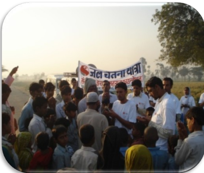
Beginning of Yatra with Pray