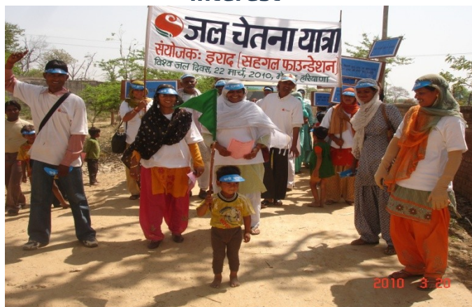
The youngest messenger of yatra carrying flag