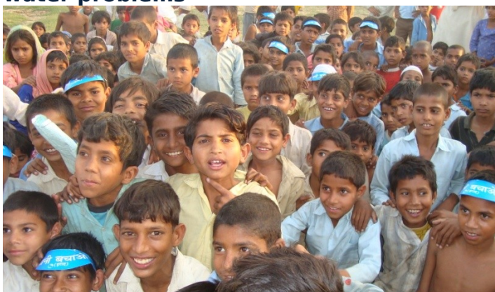
Excitement in children was amazing