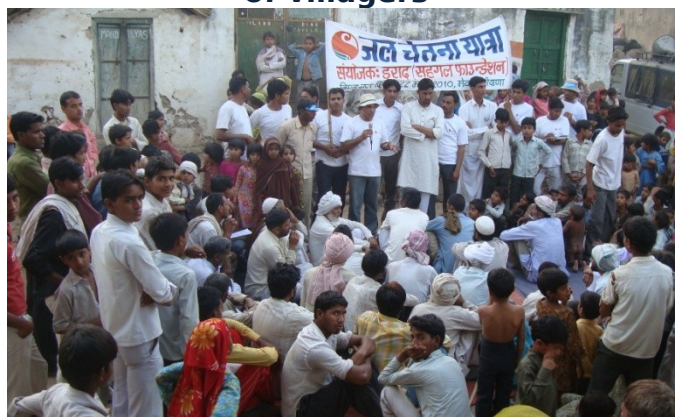
Even others participated with high interest