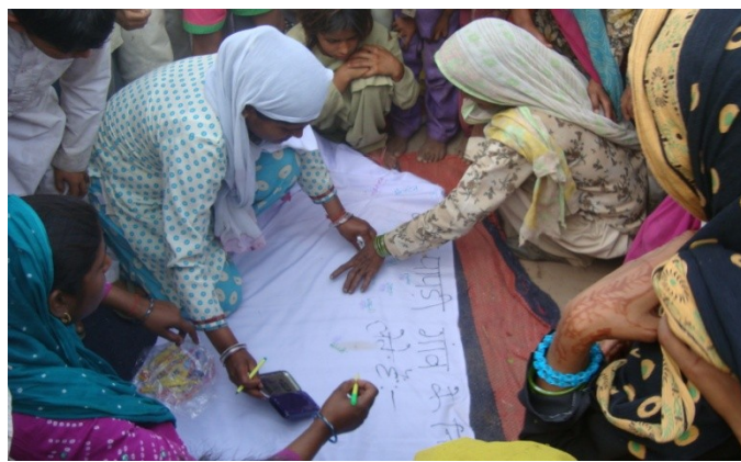
Even thumb impressions, who could not sign