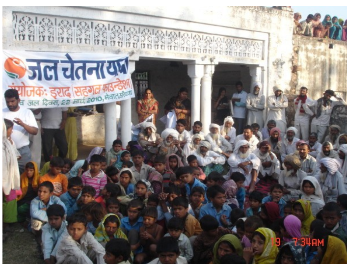
Large turnout for meetings in the villages