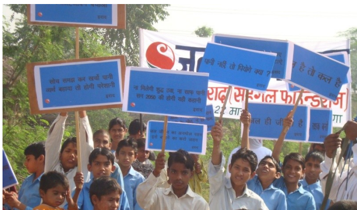
School children shouting slogans with high enthusiasm