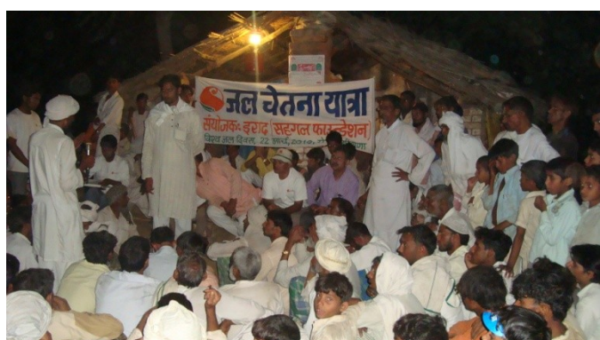
Meetings continued till late evening