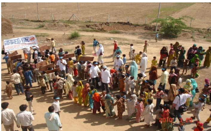
JCY converting into a mass rally/gathering