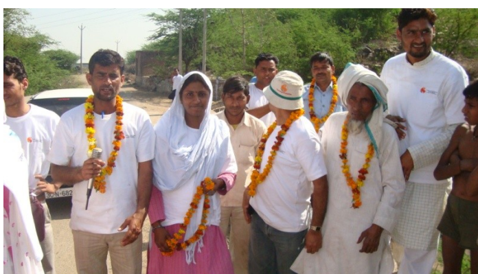
Yatra members were warmly welcomed by villagers