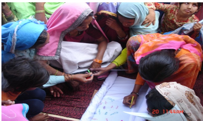
Villagers expressed commitment in signature campaign