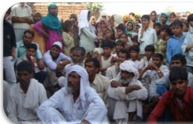
Participation by all age, sex & groups of villagers