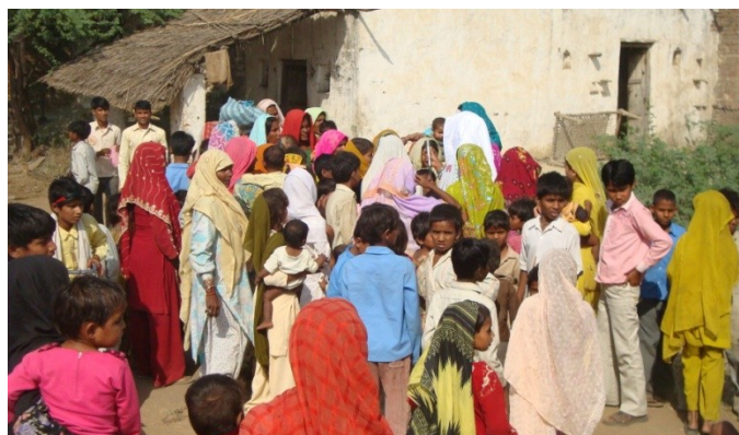
Women curiosity forced them to participate in yatra