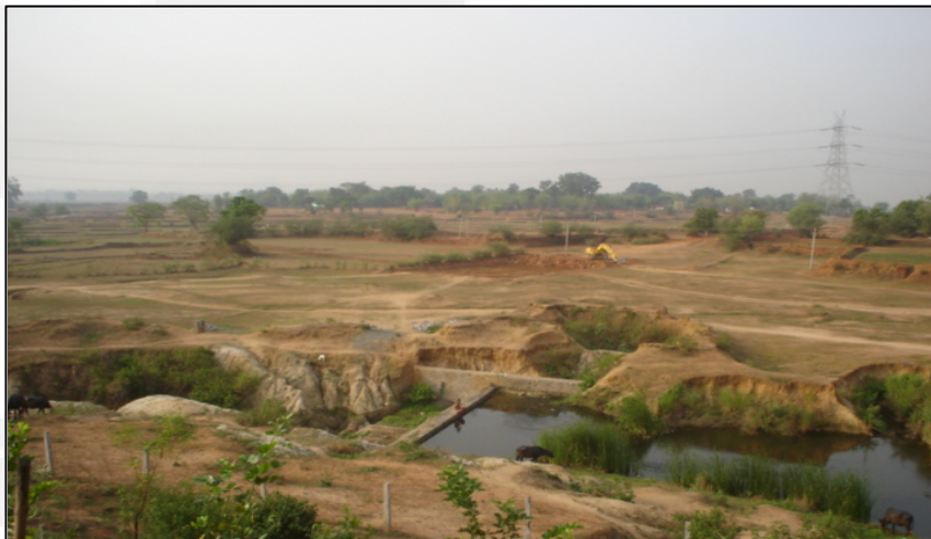
Check dam water for agriculture