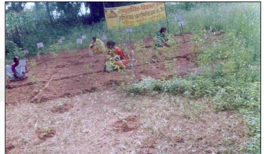
Nursery from Harvested water