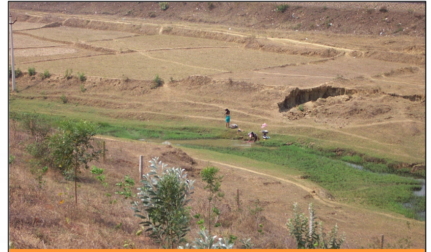
Using water at the check dams