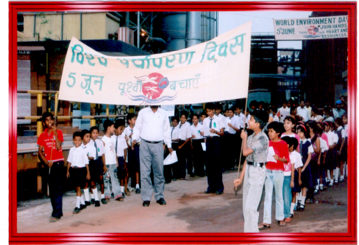
Children participating in water conservation drive