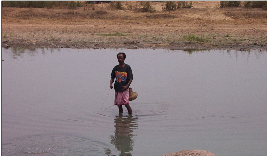
Fishing in the river and ponds