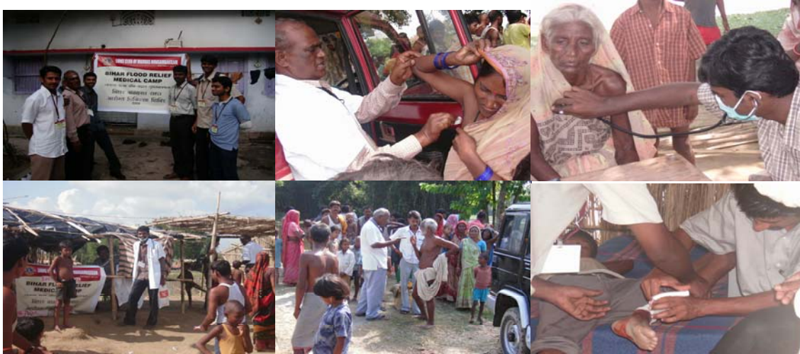
Skin Infection found in medical camp: