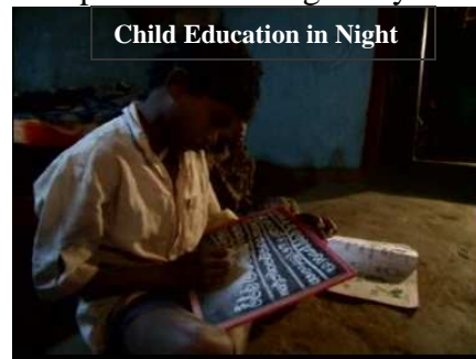
Child Education in Night

Development means a process by which we attempt to improve all aspects of the human condition – economic, social, political, and more. It should be obvious from the outset that the environment and the economy are both essential ingredients of development. When we think of sustainable development, it often means conducting improvement processes through ways and means that are consistent with maintaining improved conditions indefinitely. This is one of the most, if not the most, demanding challenge under the sustainability criteria in its environmental conditions and processes. The role of energy in this is fundamentally two sided. Energy in adequate quantities and affordable forms is clearly an indispensable ingredient of economic improvement. At the same time, energy is the dominant ingredient, and contributor to most of the difficult and intractable environmental