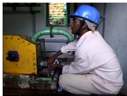
Barefoot engineer in action

Selected persons from the village community received training on the operation and maintenance of the plant, putting electrical fixtures at the household level and operation and maintenance of end use machineries. Prior to the commissioning of the plant the village community was also made aware regarding the overall aspects of the production and caution in the use of electricity, its maintenance, management and distribution of power.