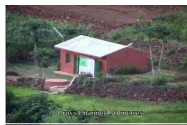
Powerhouse: At day & Night

The main beneficiaries of electrification are women. No more backbreaking hours of pounding and grinding of cereals – now they have their Mill. No more they come hurriedly from the field to do the evening cooking before it is too dark. By seven in the evening people used to go to bed in order to save on kerosene. Now they have time to attend to household chores leisurely, discuss with friends, watch TV in community center and so on. Houses are kept clean – dirt and cobwebs are easily seen with light. Children take interest in study. Leisurely cooking has improved the quality of food. Now husbands stay home in the evenings, they watch TV together or help in different work. There has been an increase in leisure time income-generating activities – most families generate additional income of about Rs.2000 in a year.