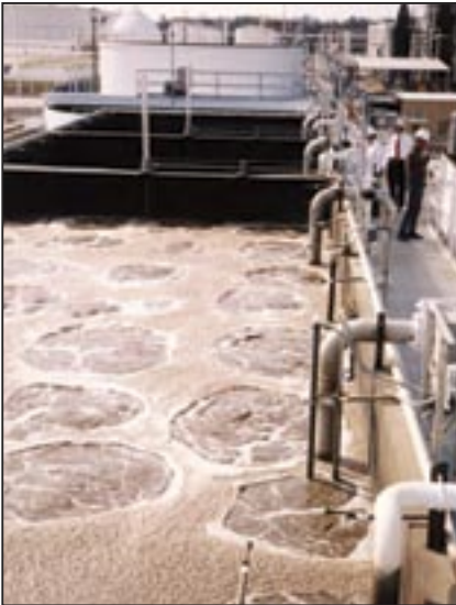
FIGURE 3. Jet aerators provide microorganisms with the necessary aeration while maintaining the suspension of biological solids without the need for additional equipment.

greater levels of treatment. Regardless of the type of system selected, one of the keys to effective biological treatment is to develop and maintain an acclimated, healthy biomass, sufficient in quantity to handle maximum flows and the organic loads to be treated. Maintaining the required population of “workers” in a bioreactor is accomplished in one of two general ways: