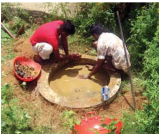
Ensuring no gas leakage in Biogas digester neck

In general, the O&M of wastewater treatment systems consists of a wide range of tasks - operational tasks, system operation expenses, equipment replacement and waste disposal. The operation and maintenance tasks are separated into regular day-to-day tasks and periodic tasks that must be carried out only at regular intervals as per the design of the treatment unit or in case of emergency. The periodical tasks are cleaning of registers, checking the biogas leakage, desludging of settlers and baffle reactors, cleaning or replacing PGF filter materials.