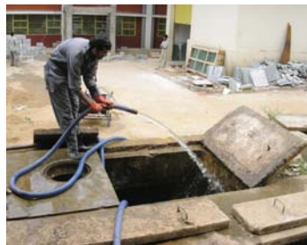
Cleaning of Settler chambers