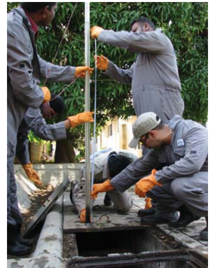
Practical training session

This 3-day training programme included theoretical sessions with practical hands-on training at the Anuma DEWATS site in Bangalore. The practical hands-on training included cleaning of pipelines, assessment of sludge, desludging of the settler and baffle reactor and cleaning of PGF filter material.