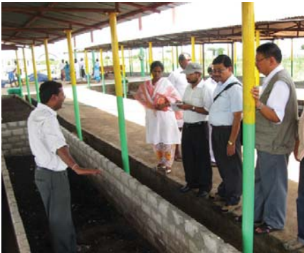
DESWAM project site, Kulithalai

The objective of the exposure visit was to orient the Hetauda Municipality officials on DEWATS and CBS projects in India, as they are in the process of establishing community managed compost plant and community toilets in their Municipality in Nepal. The expected impact was that these officials will be able to apply the knowledge gained in establishing community managed compost plants and toilets.