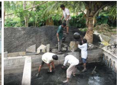
Cleaning of PGF filter materials

It is most essential that operators and care-takers have adequate knowledge of site specific tasks needed to optimise DEWATS operation. The O&M issues relate not only to technical aspects but also to social, economic, institutional, managerial and environmental conditions. The basic requirements that make for a successful O&M system are: