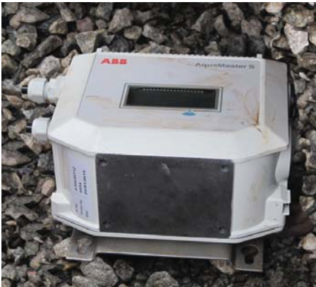
ABB Aqua Master Flow Meter

The MID flow meter built by ABB enables an accurate assessment of the daily wastewater flow generated by communities, public toilets, institutions and other beneficiary groups. The flow meter measures the exact hourly and daily flow in m 3 /hour, l/min and other suitable units. The information on daily flow helps to quantify the per capita wastewater generation, which is a crucial information for the DEWATS Design Engineers. Moreover, the absolute peak-flow and the maximum peak-flow hours can be identified. This is important for computing the upflow velocity in the anaerobic baffle reactor [ABR]. The upflow velocity is an important parameter since it indicates the time of retention of sludge and thus, bacteria inside the ABR compartments.