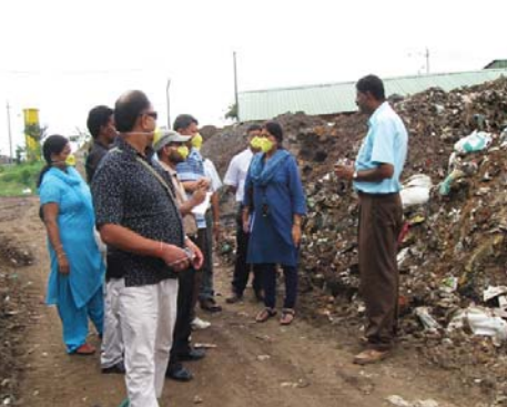
Site visit to Terra Firma, Bangalore