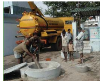
Desludging of biogas settler